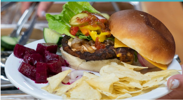
Sunday Supper Dates