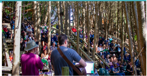
Kirk in the Cedars Dates