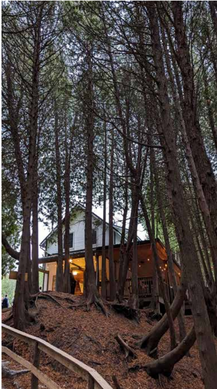
Harmony House is a seasonal meeting space with kitchen, April - November.

Harmony House was the original lodge which has since then been fully restored. This charming building has both indoor and outdoor fireplaces, offers a large meeting/dining room that comfortably seats 65 inside, and is equipped with a full kitchen available for your group to rent. In addition, there is a smaller meeting area and piano for your group to use. The exterior of the building has a large wrap around deck where you can hear Lake Huron and view the beautiful cedar forest. The covered deck around back not only offers outdoor seating, but has a propane fireplace and comfortable Muskoka chairs for your group to enjoy while being surrounded by the sounds of nature.