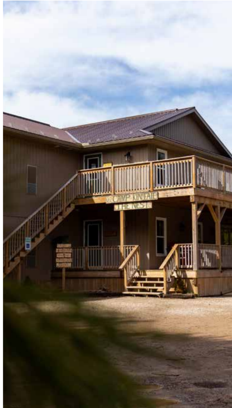
The Nest is a year-round facility.

For large group meetings, meals or activities, you will find a large room in the basement that comfortably seats 100 guests. For groups who wish to cater their own meals, there is a fully equipped kitchen available to rent. There are three additional smaller meeting and activity break out spaces. The building also houses public bathrooms and shower facilities including an accessible family washroom and shower space. The exterior of The Nest offers both an upper and lower wrap around deck for guests to use for programming, meeting, or eating. The outside decks are the perfect space to enjoy a morning coffee and watch the sunrise, or to host a paint night!