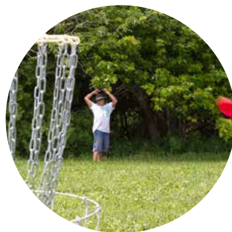
18 HOLE DISC GOLF