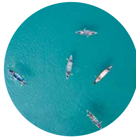
BOATING - CANOES, KAYAKS, PADDLE BOARDS & CORCL'S