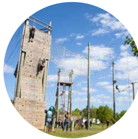
HIGH CHALLENGE COURSE

Reach for the sky with our High Challenge Course. We offer a variety of high rope elements, an adventure tower and rockwall. Our adventure tower has 4 sides that climbers work together to solve and a cargo net down the middle. Our rockwall has 3 sides, 6 different routes with a variety of different shapes and holds for guests to explore.