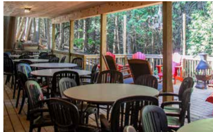
Harmony House is a seasonal meeting space with kitchen, April - November.

Harmony House was the original lodge which has since then been fully restored. This charming building has both indoor and outdoor fireplaces, offers a large meeting/dining room that comfortably seats 65 inside, and is equipped with a full kitchen available for your group to rent. In addition, there is a smaller meeting area and piano for your group to use. The exterior of the building has a large wrap around deck where you can hear Lake Huron and view the beautiful cedar forest. The covered deck around back not only offers outdoor seating, but has a propane fireplace and comfortable Muskoka chairs for your group to enjoy while being surrounded by the sounds of nature.